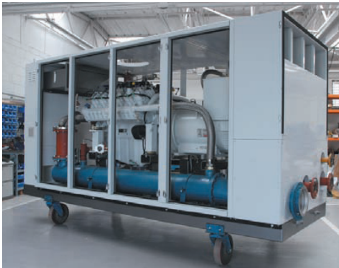
The cogeneration boiler from Ener.G comes as a pre-engineered package solution driven by a Cummins generator. It is branded in Canada a Power Ecosystem.

ensure that the unit is extremely quiet, well under regulatory requirements and there is no vibration so it is virtually disturbance free to tenants or neighbors.